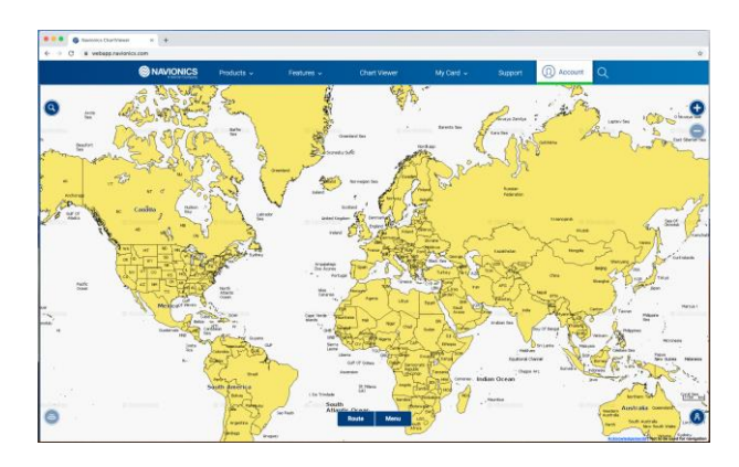
Chart Viewer Web API