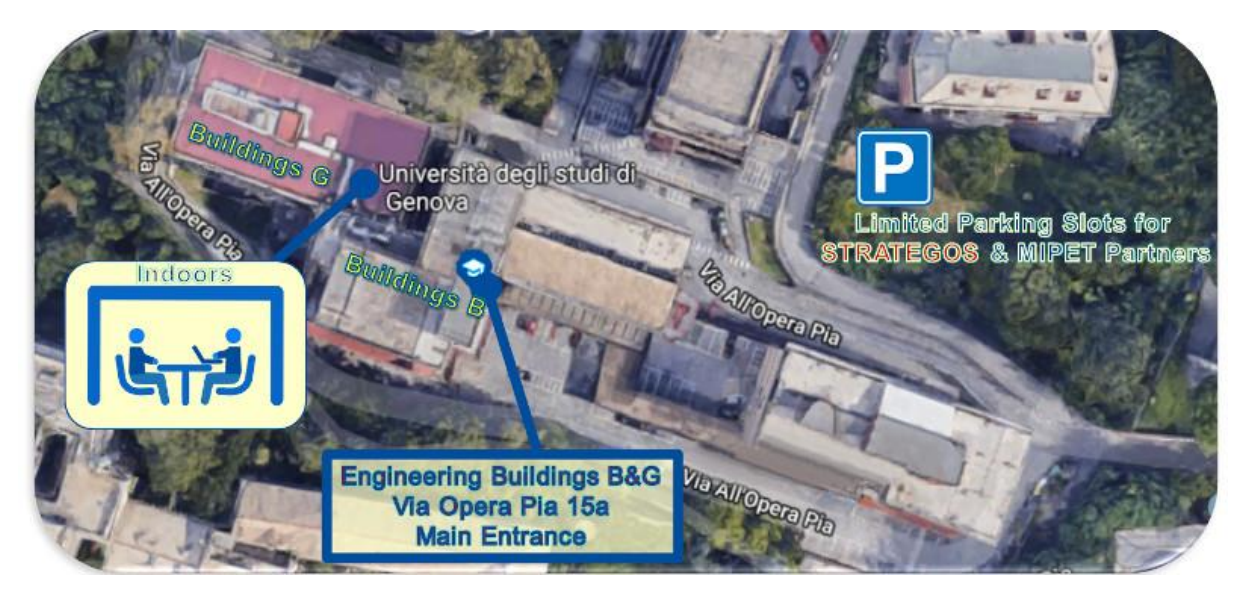
Afternoon & Campus Interviews: Click Here for Directions